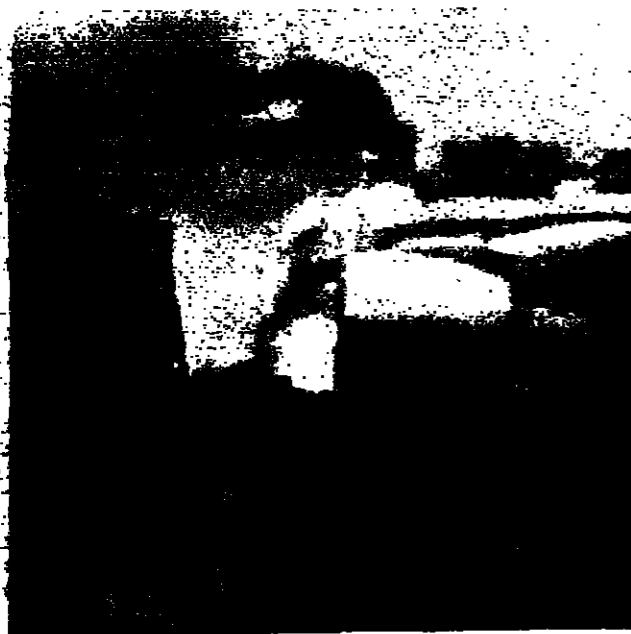
CRUZ BURNS -- A Spanish fireman plays a stream of water on the burning wreckage of one of two Boeing 747 jetliners crashed in Santa Cruz de Tenerife, in the Canary Islands, (AP wirephoto).

CRUZ, Canary Islands, 28 (R). — The death toll following runway collision jumbo jets rose to 562 as a top investigator said that the tourist-packed jet crashed into each "nearly head-on" at Teide airport yesterday. Spanish military authorities a mantle of official secrecy investigations into the worst aviation disaster in the world.